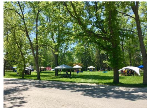
Some of the amazing stations at the “Tri-County Children’s Water Festival”.