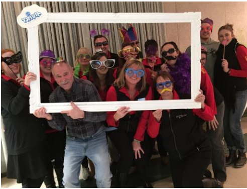
Some of our awesome staff members enjoying the VON Trivia Challenge!

Quinte First participated in many different community events and partnered with many fantastic community organizations this quarter! In April, we had an awesome evening with two Quinte First teams participating in the VON Trivia Challenge in Trenton. We also had lots of fun riding the “Big Bike” in Trenton and Belleville in May to raise money and awareness for the Heart & Stroke Foundation.