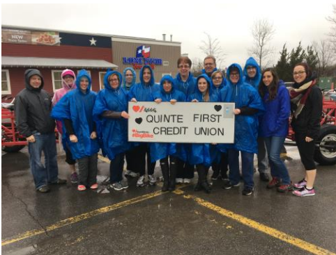
“Big Bike” Race for the Heart & Stroke Foundation in Belleville.

It was awesome to see all of the different types of tree species, and to help with packaging all of these trees. Lower Trent also hosted the “Tri-County Children’s Water Festival” in Batawa on May 24 th and 25 th ! This event sees over one thousand students from all across the Quinte region, and it was an awesome opportunity to learn more about conservation practices and how important protecting our watershed is. Quinte First Credit Union also made a $1,000.00 donation to Lower Trent Conservation’s “Connecting KIDS with NATURE” program in 2018. Thank you so much to Lower Trent Conservation for these wonderful opportunities to volunteer and learn about conservation in the Lower Trent watershed!