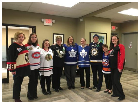
Our awesome Corporate team sporting their jerseys in support of the Humboldt Broncos and “Jersey Day”.