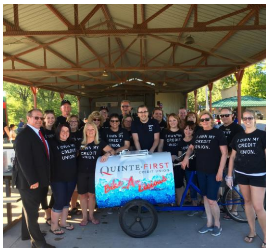
Enjoying Community Appreciation Night and the treats in Bike-A-Licious!