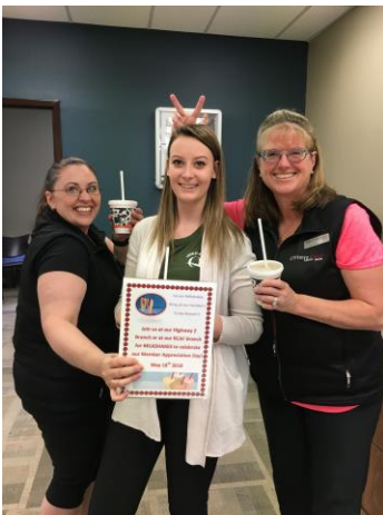
The ladies at RCAF enjoying milkshakes at Member Appreciation!

At Quinte First Credit Union, we love our community, and we always put our members first. We are community focused and community oriented, and we are locally owned and operated.